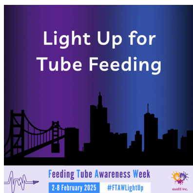
Light Up Social Media Tile

We are supporting Feeding Tube Awareness Week (2-8 February 2025) by illuminating our landmark [colour] on [date] to shine the light on tube feeding. ausEE Inc. hosts Feeding Tube Awareness Week (FTAW) to raise awareness about tube feeding and unite the community. Find out more at https://feedingtubeaware.com.au/#FTAW2025 #TubieTuesday #FTAWLightUp