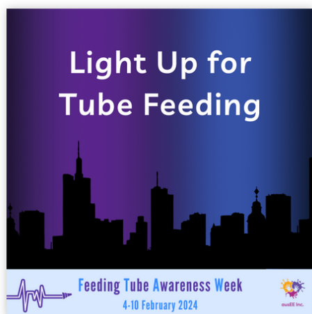
Light Up Social Media Tile

We are supporting Feeding Tube Awareness Week (4-10 February 2024) by illuminating our landmark [colour] on [date] to shine the light on tube feeding. ausEE Inc. promotes Feeding Tube Awareness Week (FTAW) to raise awareness about tube feeding and unite the community. Find out more at https://feedingtubeaware.com.au/ #FTAW2024 #TubieTuesday #FTAWLightUp